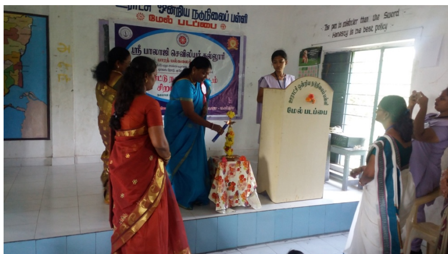
SPECIAL CAMP INAUGURATION -LIGHTING KUTHUVILAKU