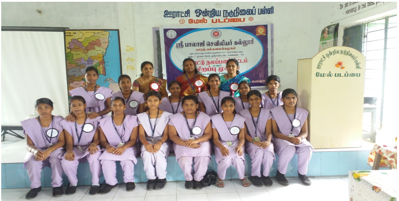
NSS VOLUNTEERS AND PROGRAMME OFFICERS