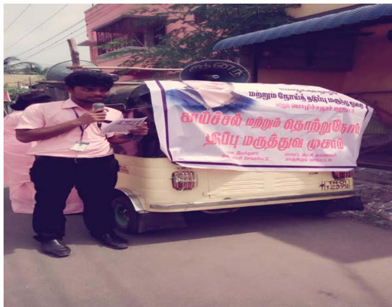
DETECTION OF MOSQUITO BREEDING PLACES