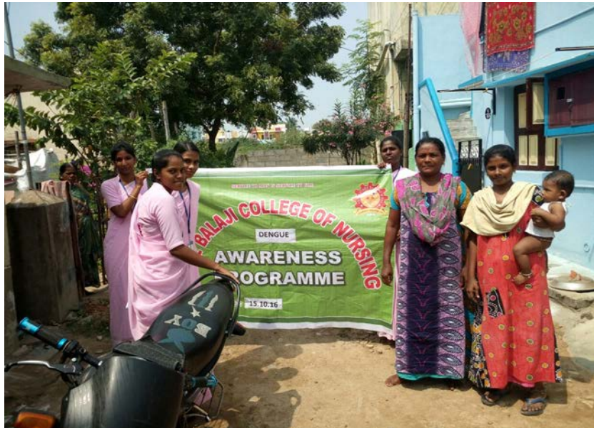
AWARENESS AND PREVENTIVE MEASURES FOR DENGUE